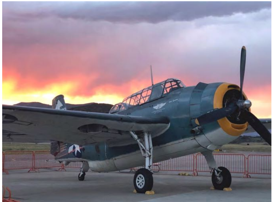
Col Kaleb Julius caught this spectacular "...raining fire in the sky" view of "309" sitting on the ramp at Steamboat Springs. Wow! Thanks Kaleb!