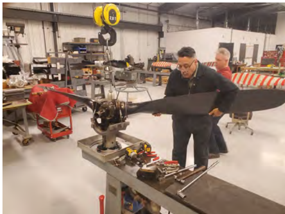
Disassembly of "309's" Hamilton - Standard Propeller begins.